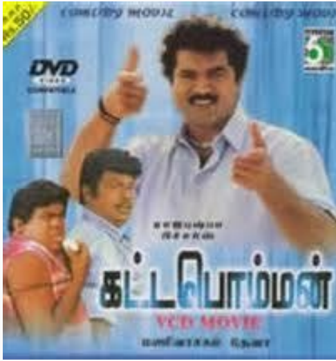
Cheran pandiyan padam. Cheran pandiyan padam padam.